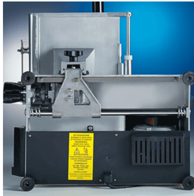
Underside motor protection plate