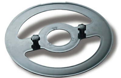
Blade removal tool