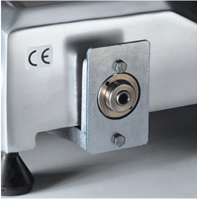
Device for releasing the carriage