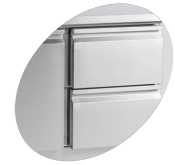
Drawers as option