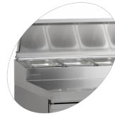
GN1/6 cooling well