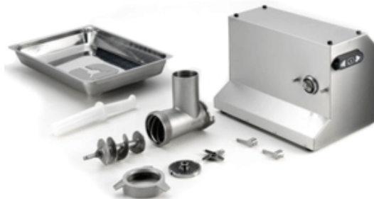
Optional Format M