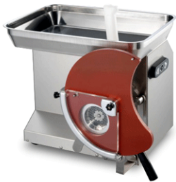
Optional Format M