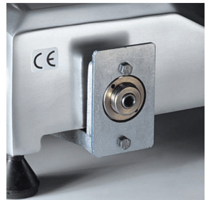
Device for releasing the carriage