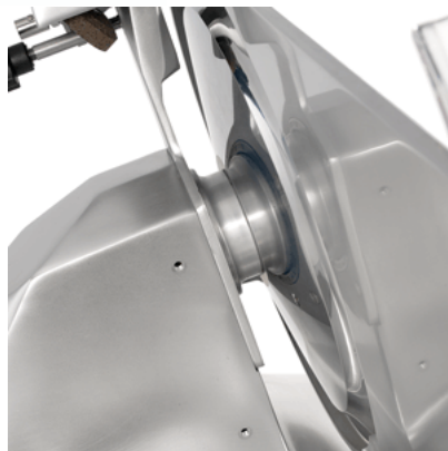
More space between blade and body machine