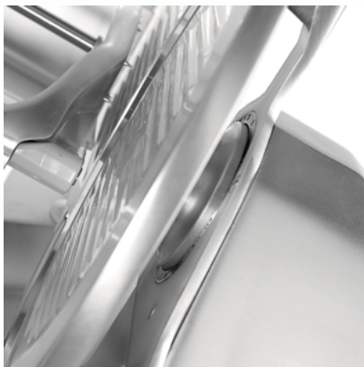
Enclosed and sealed belt pulley standard