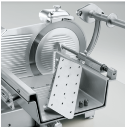
Removable food pusher VCS