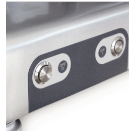
Controls on body (push-buttons IP67)