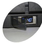
Protective thermostat cover